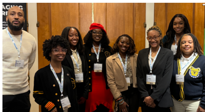
The first cohort of HBCU Aging Ambassador Program Fellows

Nine undergraduate and graduate students from HBCUs and Minority Serving Institutions attended as the first cohort of HBCU Aging Ambassador Program (HAAP) Fellows, representing Grambling State University, North Carolina A&T, Prairie View A&M, Howard University, Chicago State University, and Winston-Salem State University. In addition, the conference featured a collection of dynamic speakers, including alumni from HBCUs, experts from community-based organizations, and representatives from the National Institute on Aging who spoke on the significance of HBCUs in shaping the future of aging research.