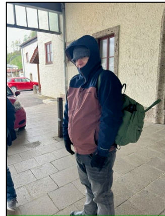
The Editor Freezing in Germany this past May.